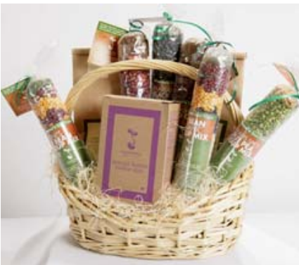
BreakOut was selling baskets like this one at the Arts & Crafts Fair on Dec. 6 & 7.

Also being sold alongside the BreakOut fundraising beans, were T-shirts, Bags, and Scarves, whose proceeds benefited the service trip to India. The service trip will take on December 27th. A group of 12 students will stay in India for three weeks building kitchen gardens in rural village homes and teaching the villagers the importance of hygiene. For $10, those who bought scarves, bags, and T-shirts at the fair not only contributed to their sense of fashion, but also to their sense of goodwill.