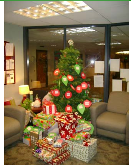
The Center for Service and Learning collected over 100 gifts from the CC community to donate to families in need.

T his holiday season, two families in need will receive presents from the CC Community. The two families made wish lists for each family member. The gift wishes were then typed out and hung on a Christmas tree in the Center for Service and Learning. Many people participated and each family received most of the presents they wished for. The two families: